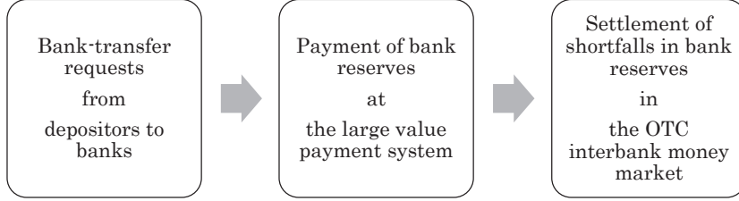
(a) Interbank payment system in practice